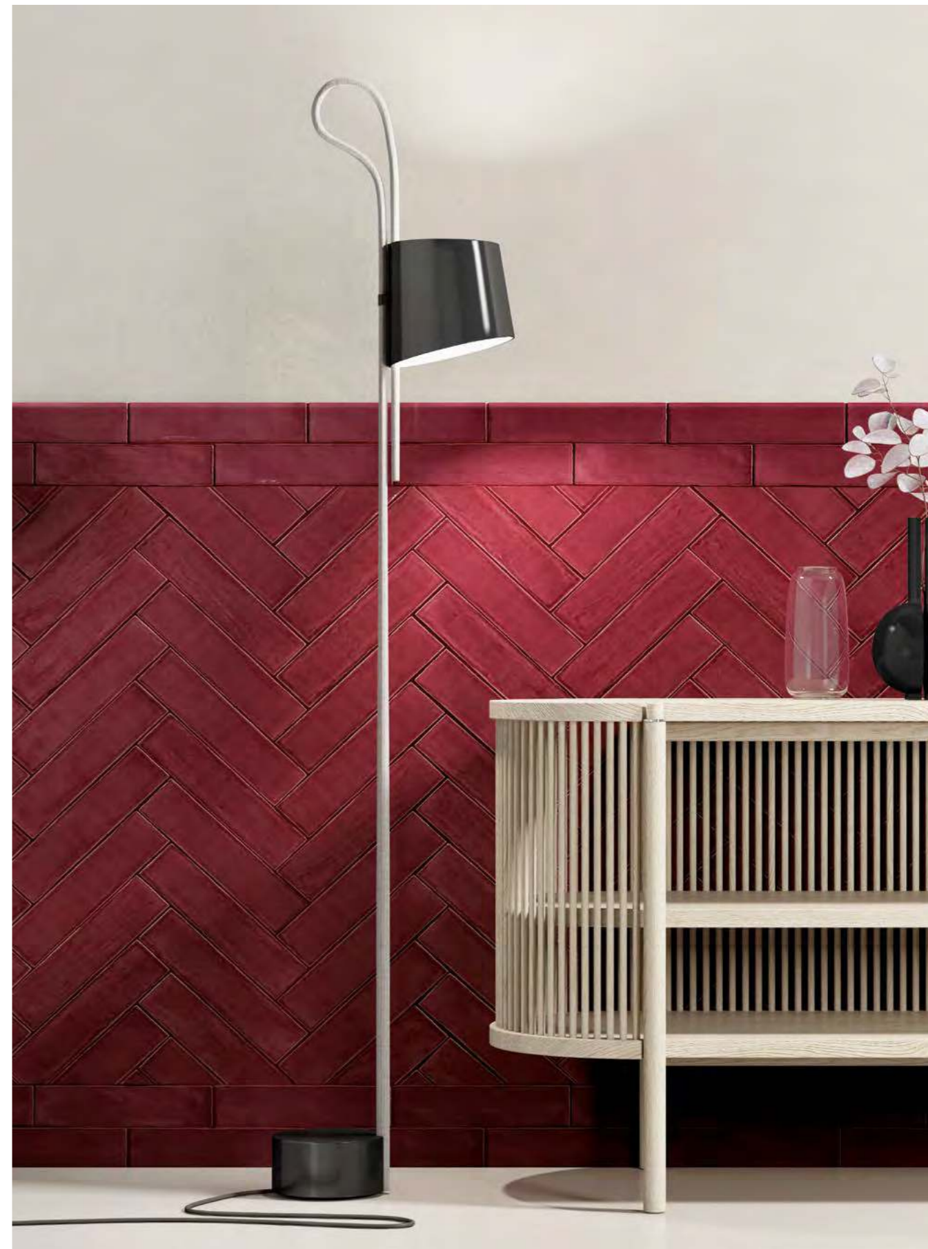
POITIERS BORDEAUX/30 · TRIM.POITIERS BORDEAUX/30

POITIERS, una de las colecciones emblemáticas de HARMONY rejuvenece y amplía su extensa oferta de colores con la incorporación de 3 nuevas referencias. La oferta más amplia en cuanto a colores de la marca en un producto sugerente y atemporal.